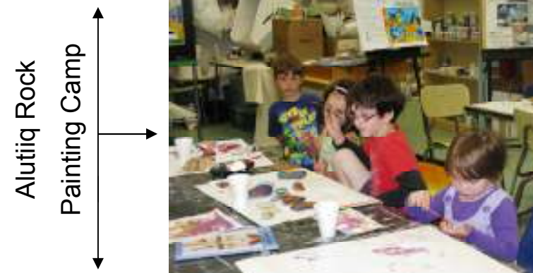
Alutiiq Rock Painting Camp