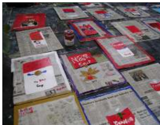
Painting with the Masters Camp