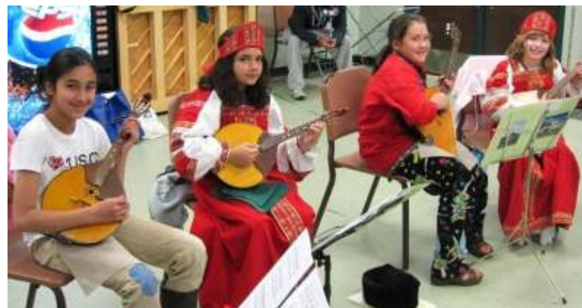
Russian Culture Camp